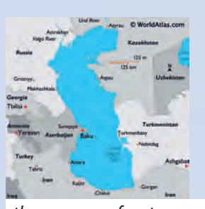
the expanse of water 2